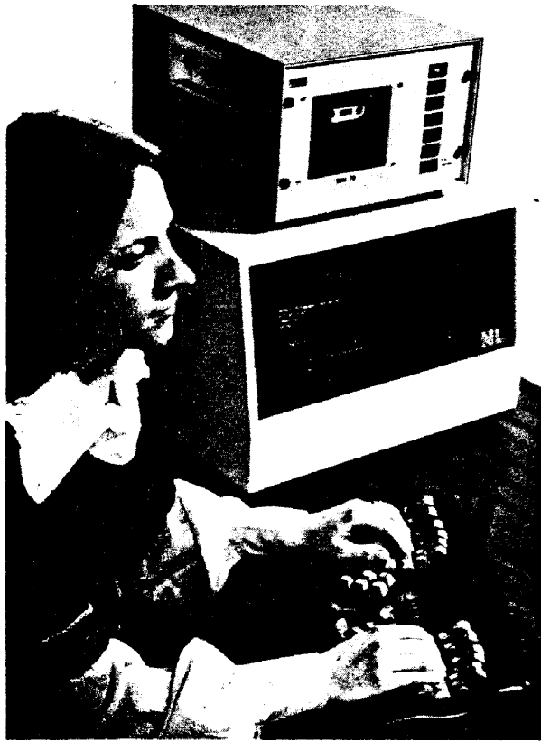
Fig 2 PCD-Maltron keyboard with mag tape output and visual display unit

benefit. The PCD—Maltron keyboard allows operators to use it with either the qwerty letter layout, or with the Maltron Mark II letter layout as they wish. The changeover to the new design can be made quickly and easily and requires only from five to 10 hours' practice. High speed operators who have tried this have said that this changeover is easier than moving from a standard typewriter to an electric one. The index fingers have most relearning to do because the awkward and uneven stretches to the centre rows have been eliminated.